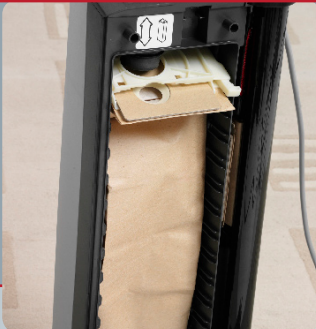
The dust bag is 'universally' sized and is easy to interchange